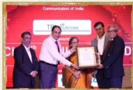
Transforming Lives Award for CSR Communications Larsen & Toubro