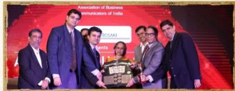
Magazine of the Year Award Team Bank of India