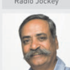
Mr. Piyush Pandey Chairman, O&M