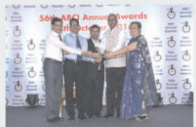
Union Bank of India, Champion of the Champion