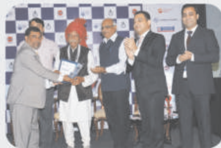
Mahashay Dharampal Ji MDH Group, New Delhi Indian of the Year