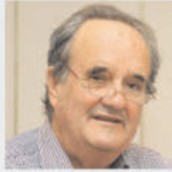
Sir Mark Tully Former Bureau Chief, BBC, for India & South Asia