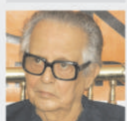
Mr. R K Laxman The Most Famous Cartoonist