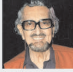
Mr. Alyque Padamsee Brand Guru