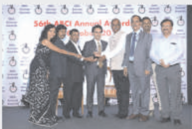
NABARD, Champion of the Champion