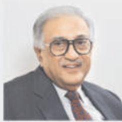
Mr. Ameen Sayani The Presenter of BINACA Geet Mala from Radio Ceylon He is the First Radio Jockey