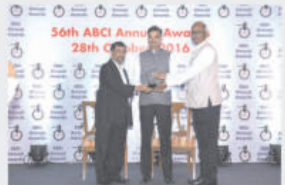
Ministry of External Affairs, Champion of the Champion