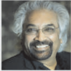
Mr. Sam Pitroda Founder of India's Telecommunication Revolution