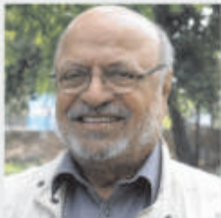
Mr. Shyam Benegal Noted Film Maker