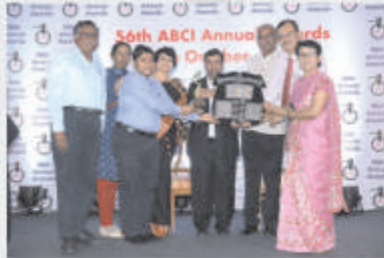
Indian Oil Corporation Limited, Magazine of the Year