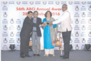
Maxposure Media Group, Champion of the Champion