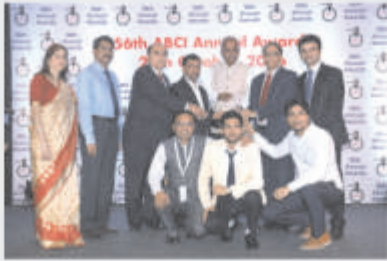
Bank of India, Champion of the Champion