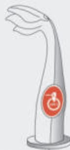
Social Media Outreach Campaign During Calamity, BSNL, New Delhi