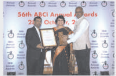
Excellence Exemplified in Handling Crisis Communication Management, Indian Oil Corporation Limited, Chennai